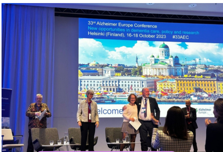
EWGPWD Plenary Session